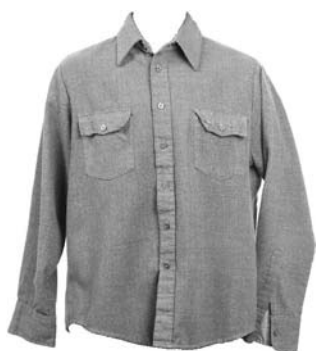
A a shirt

A You went shopping and bought three things, but now you want to return them.