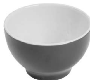
C a bowl