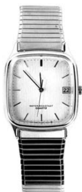
B a watch